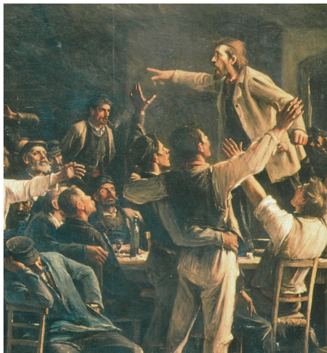
▲ Hungarian workers meet to plan their strategy before a strike.

In 1919, the U.S. Supreme Court objected to a federal child labor law, ruling that it interfered with states' rights to regulate labor. However, individual states were allowed to limit the working hours of women and, later, of men.